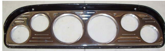
Front View Installed